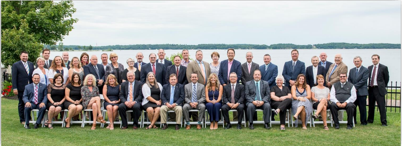
2016-2017 NYSPHSAA Central Committee, Staff and Officers