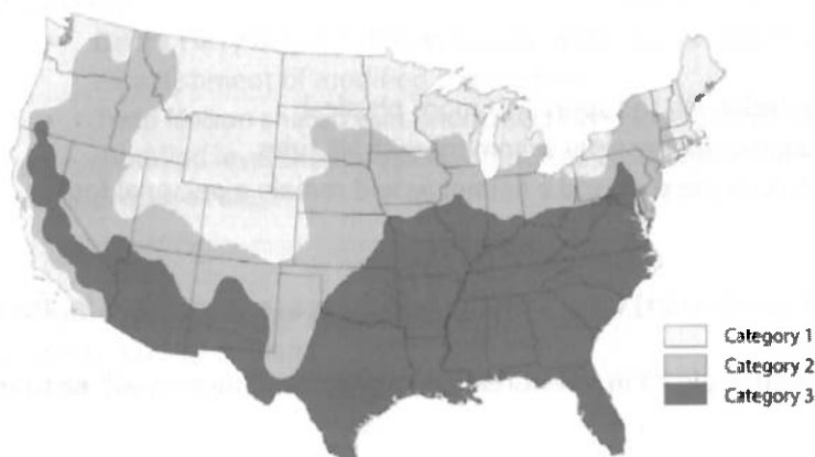
Fig. 2. Heat safety regions.