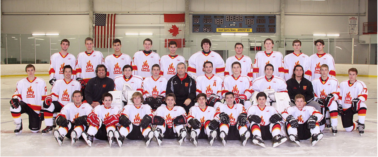
Williamsville East - Division II