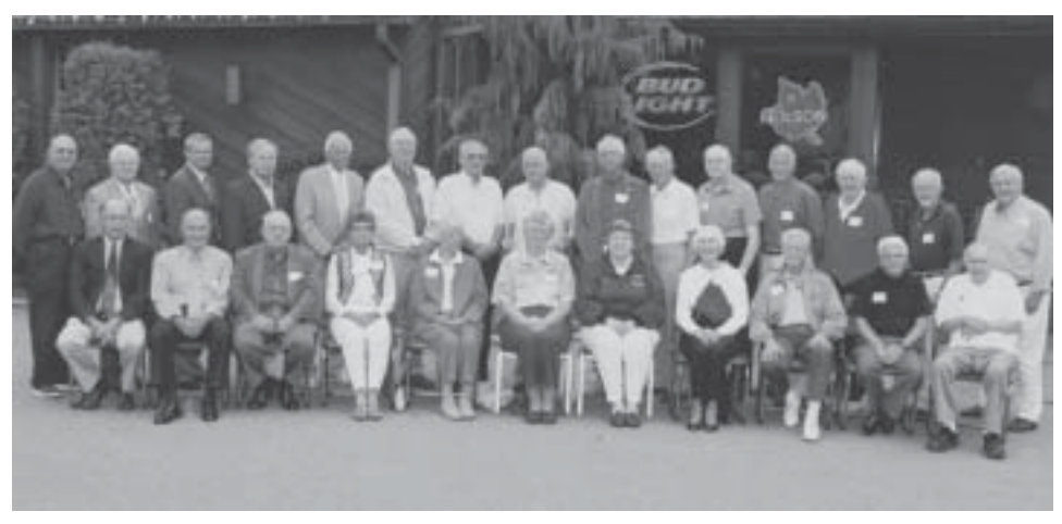
Section 6 veterans met in September of this year for a golf outing and dinner at Danny's South

Section VI Newsletter November 2006 Page 3